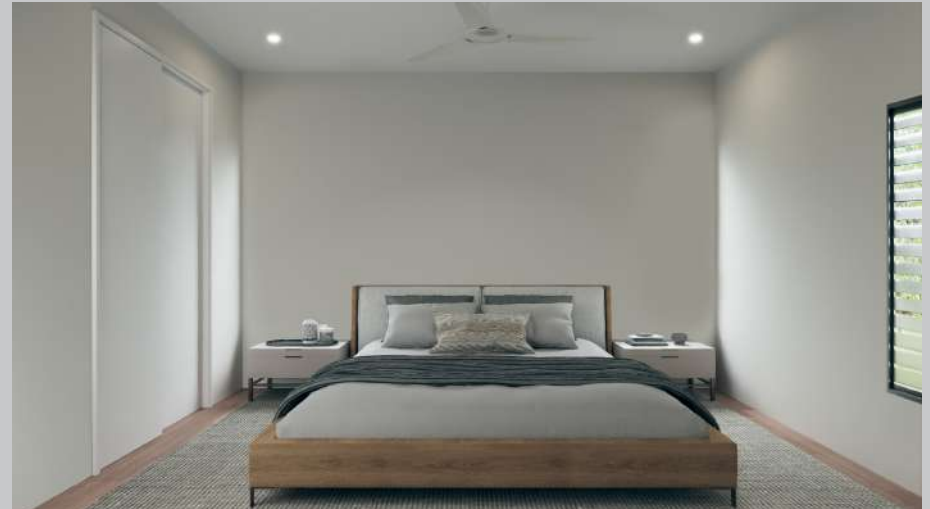
The Sealla Bedroom * For illustrative purposes only