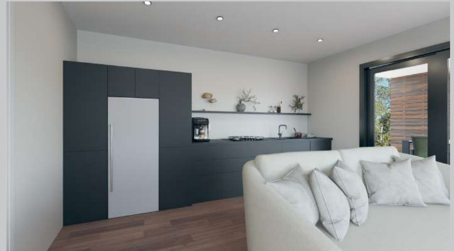
The Sealla Living * For illustrative purposes only